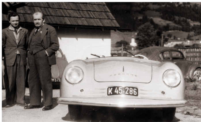
Erwin Komenda and Ferdinand Porsche with the 1948 Porsche "H1". At right the first Porsche Sales Brochure, produced in 1948.